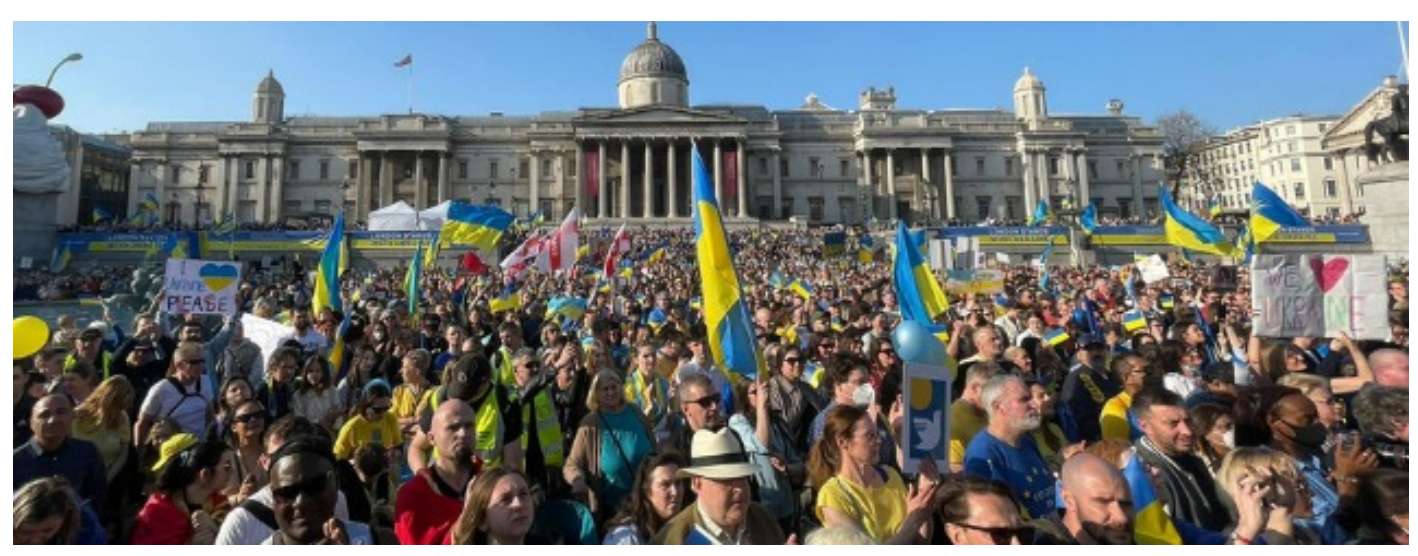
European Movement Demonstration for Ukraine. Trafalgar Square 26th March 2022