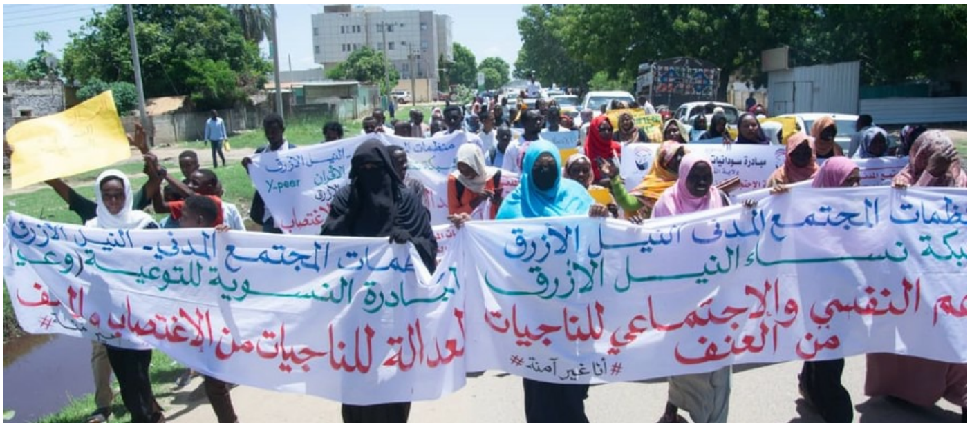
Demo in Ad-Damazīn marching to the Blue Nile state Ministry of Justice, May 17 co-convended by the NGO Waging Peace, came together weekly for 9 weeks to find ways to help for the survivor of the Blue Nile rape and her family.

In spite of the threats to their safety, women in Sudan are countering the traditionalist narrative. Sudanese diaspora members are also vocal. For instance, a UK-based group of Sudanese women’s rights activists,