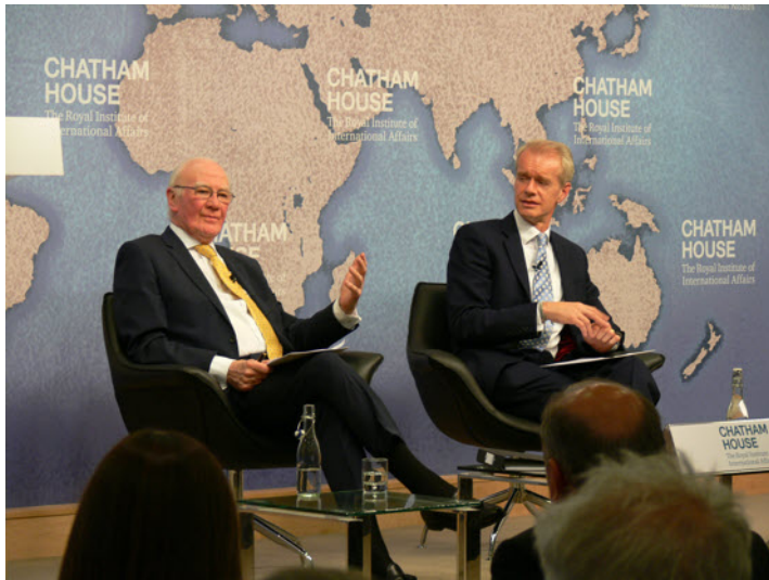
Sir Menzies Campbell and Stephen Sackur

nihilistic to say that the EU does not need reform as it is to say Britain must either be in or out. This is a union which can be revived while at the same time its core values are preserved. For the United Kingdom this is more likely achieved by constructive engagement rather than the threat to withdraw. Those of us who support Britain's continued membership of the European Union have failed on two counts. I do not exempt myself from this criticism. Our first failure has been to concede ground to the sceptic argument by failing adequately to continue to put the case for membership and by relying too much on the assumptions of 1975. One indication of this failure has been political parties' unwillingness to speak up for Europe, even in the most recent elections to the European Parliament, to the extent that when one party leader decides to make the European case his decision to do so is not universally approved of in