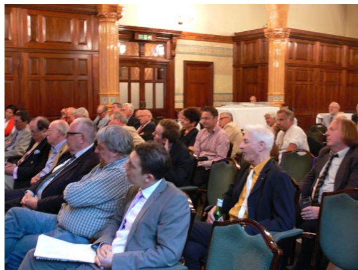
Members at the post-AGM Forum on World War One.